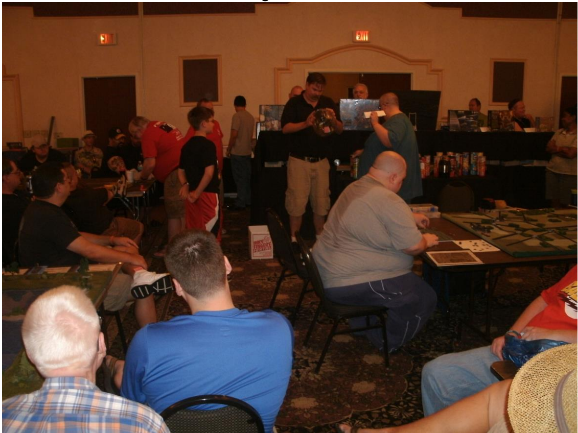
And The Inevitable Raffle/Auction