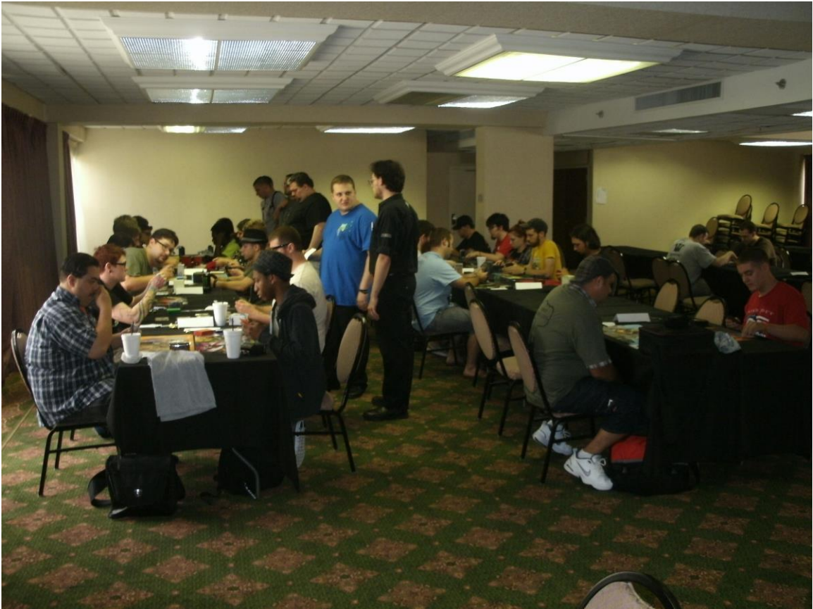
As Well As The Old Center Of Gravity