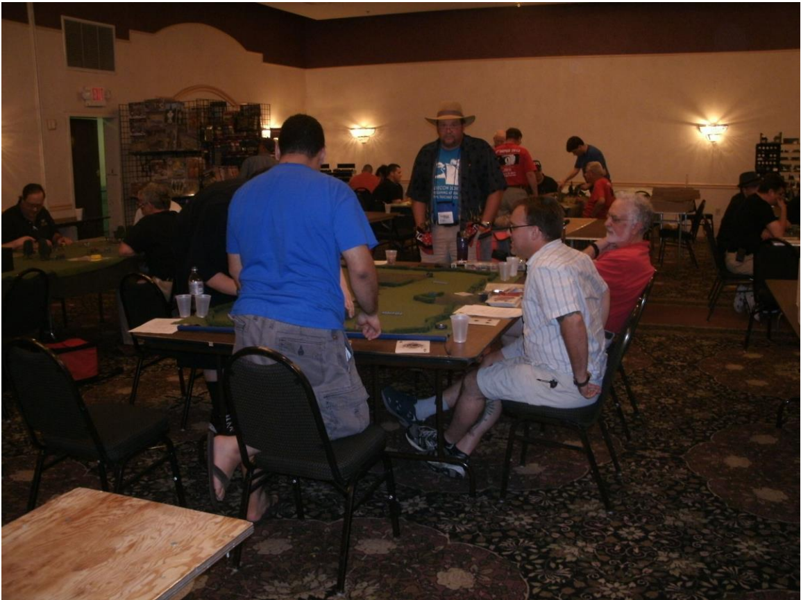
May Be 3mm Modern-Hard to Tell For My Old Eyes