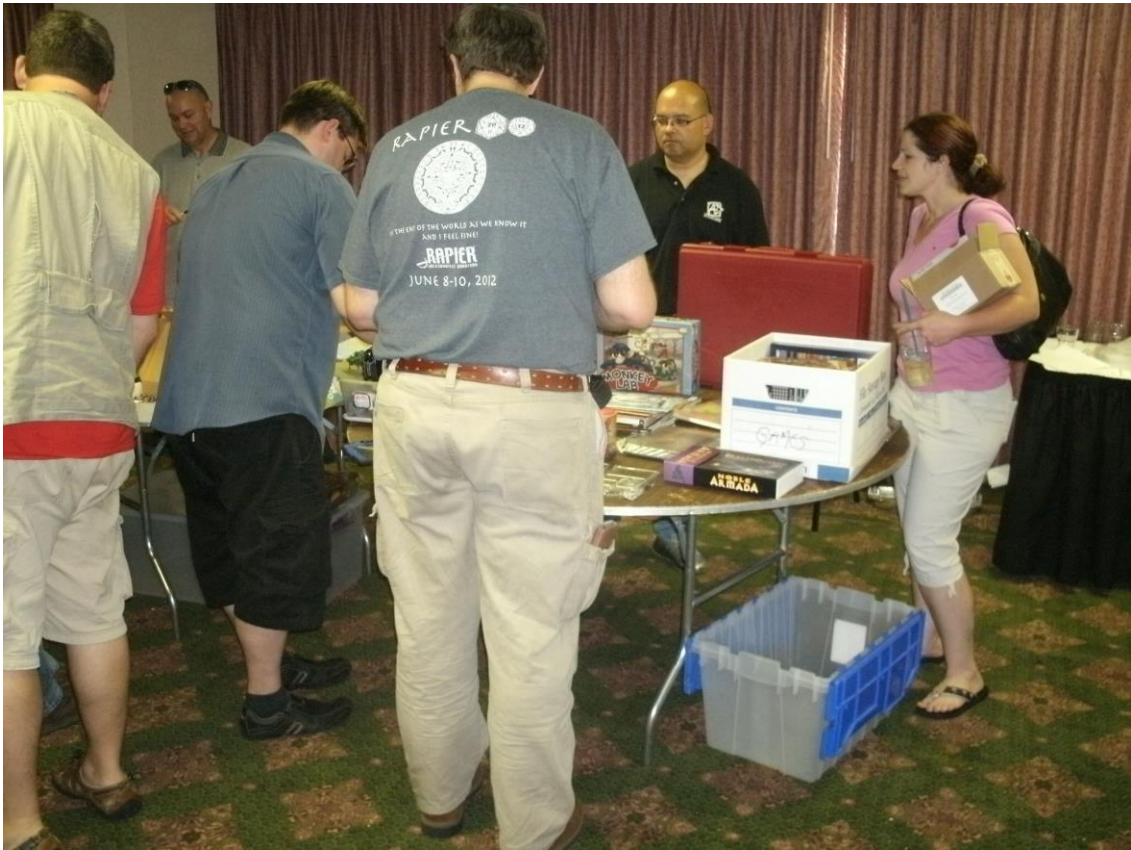
Towards Evening Came The Flea Market