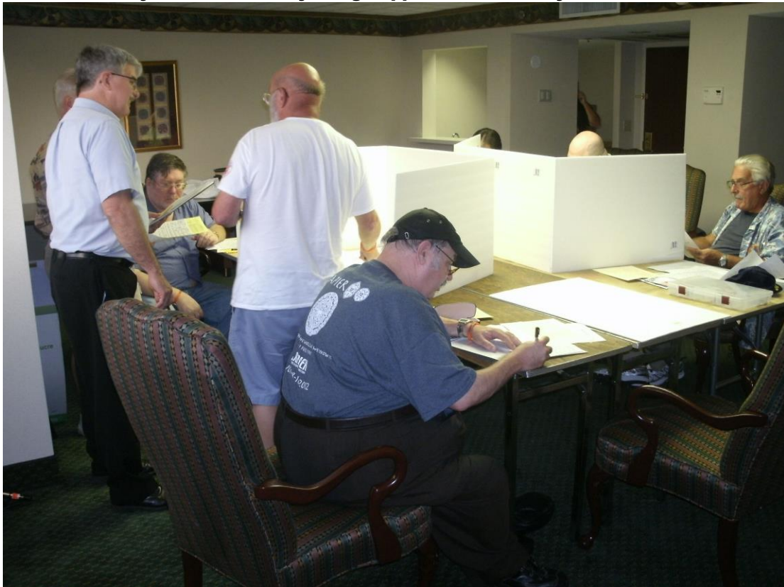
Seekrieg Admiralty's Double Blind "MIDWAY"