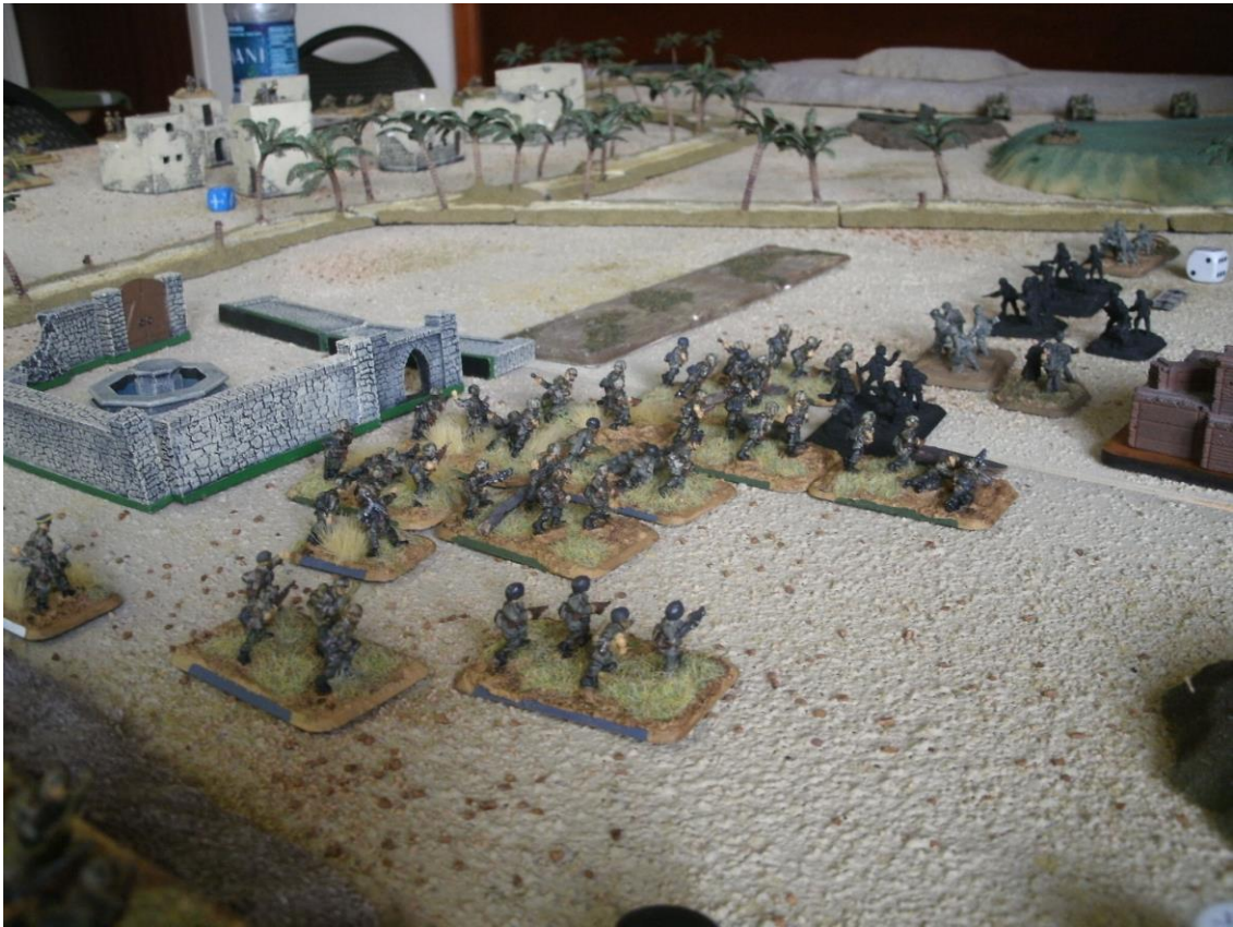
FOW Tournament-Flank Attack Closes In