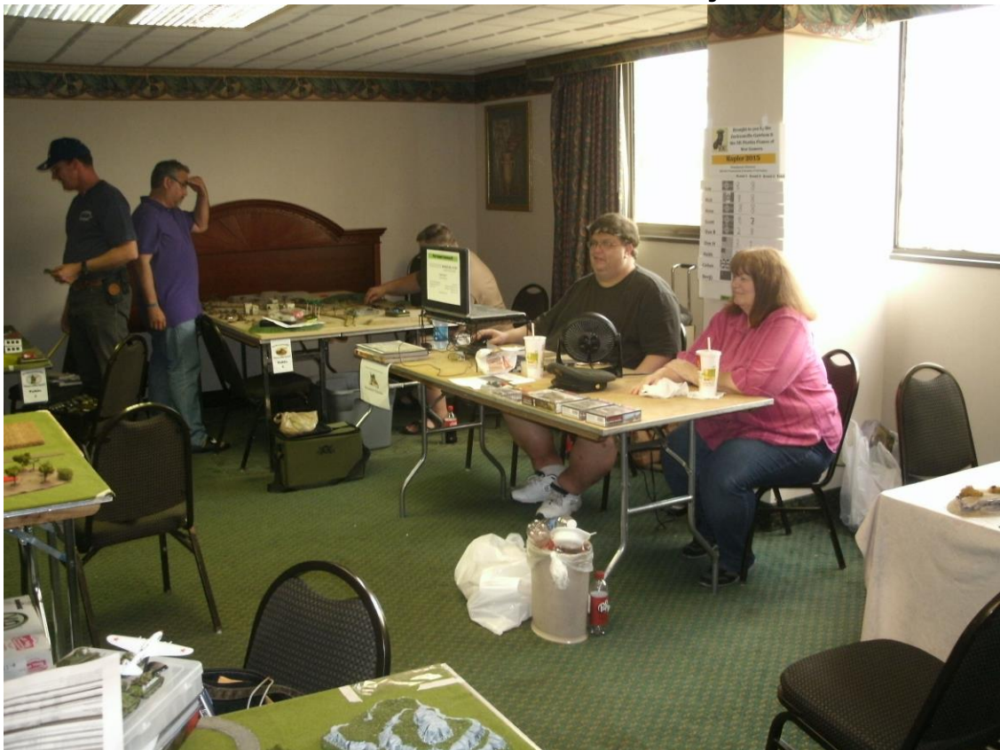
Upstairs The Northeast Florida FOW Gamers Were At Work