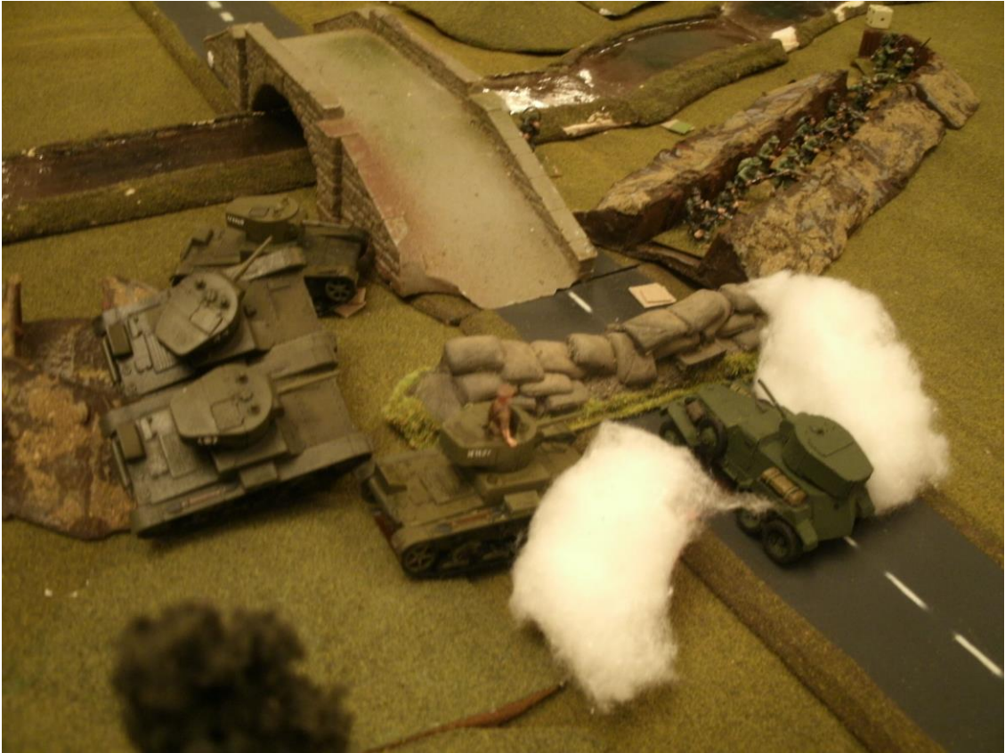
The New Catalonian Plastic T-26b Makes Its U.S. Debut In My Brihuega Game