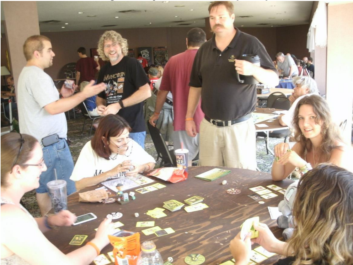
Meanwhile The Old Restaurant Was Lively