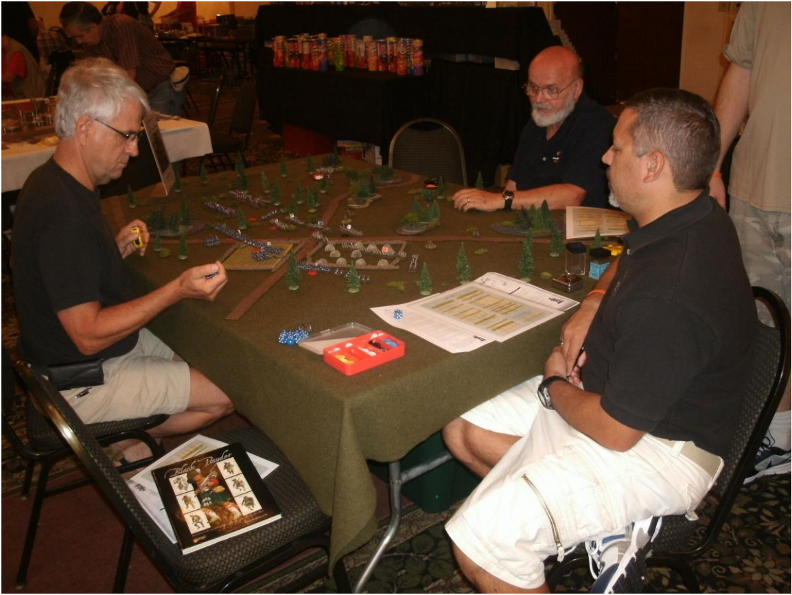
And A Recent Innovation-Black Powder ACW In 10mm