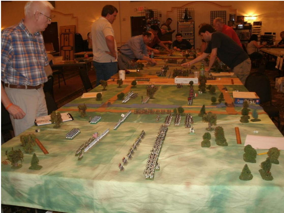
And The 1960s Classic Column Line And Slaughter Returned