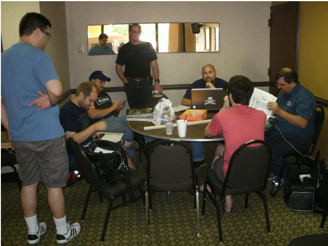
All Convention Long A Conspiracy Called Pathfinder Met Off The Main Lobby