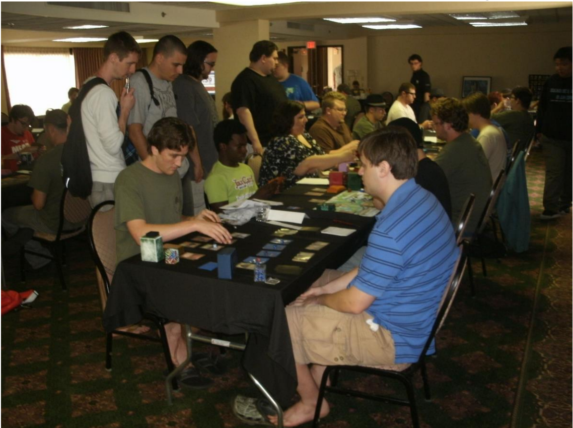
And On The Other Side The Card and Miscellaneous Gamers Were Busy