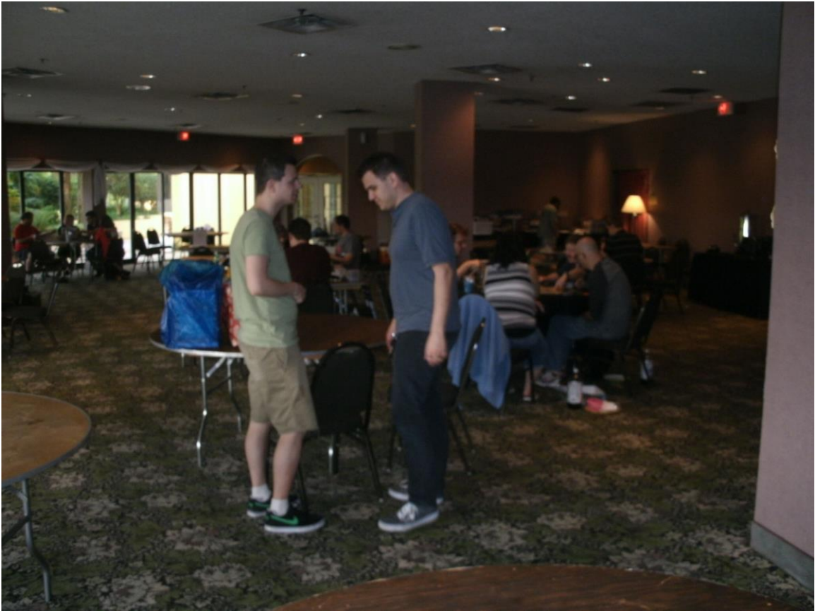
Meanwhile In The Old Restaurant The Board Games Were Building Up