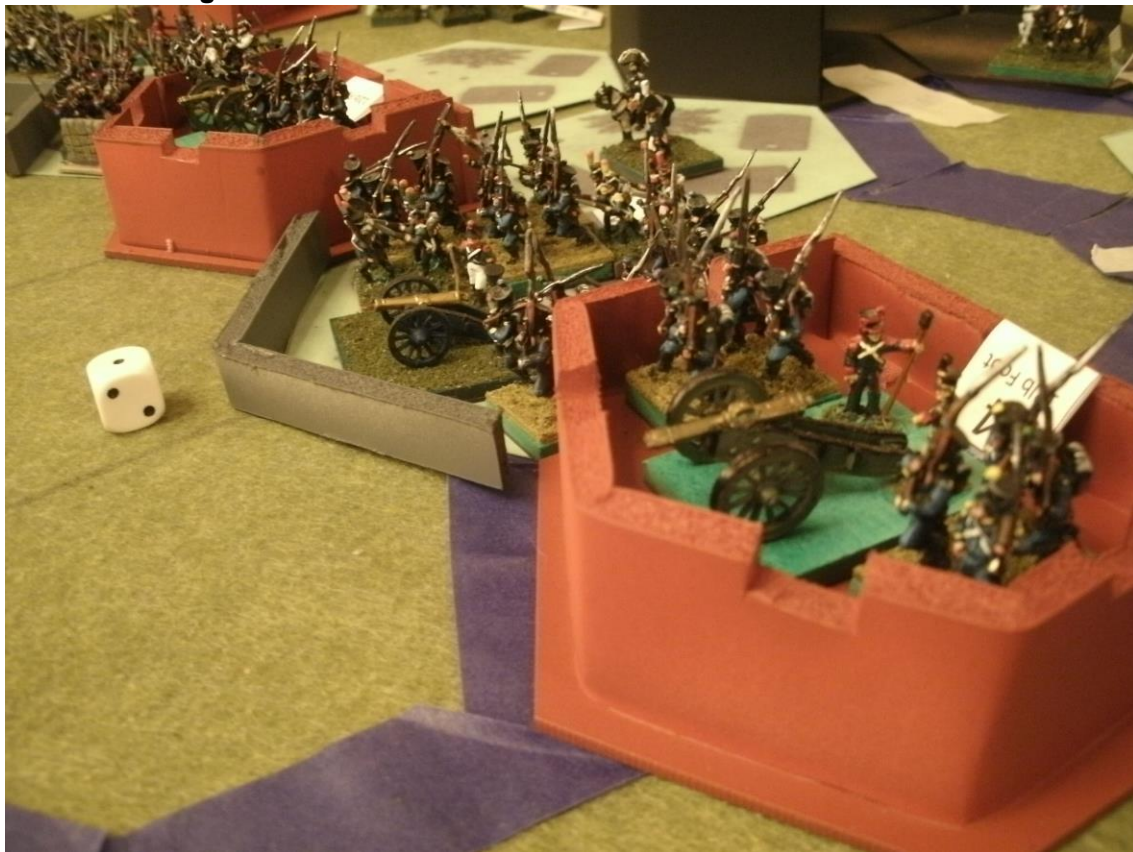
The Walls Of Dresden