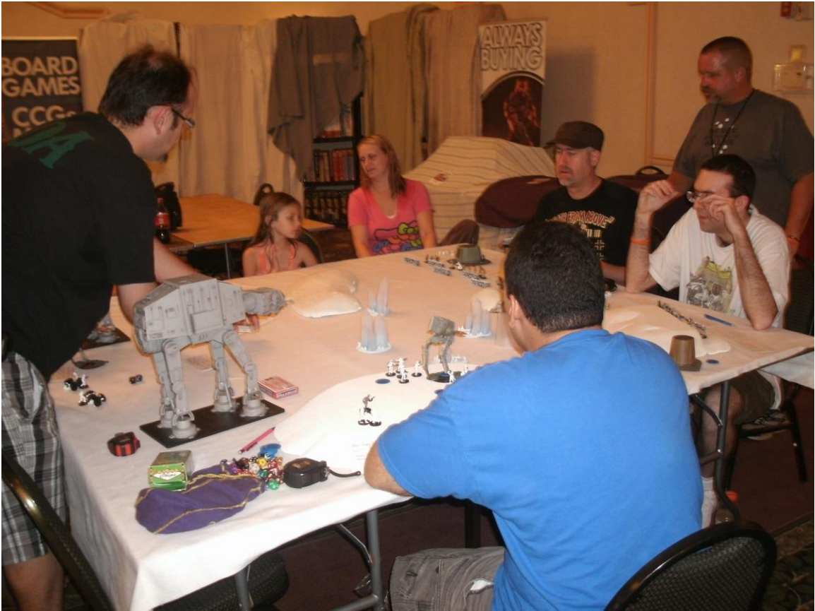
Looks Like Star Wars