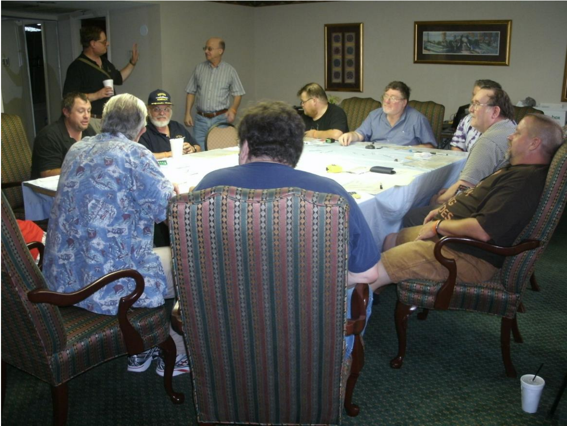
The Seekrieg Admiralty Held Course And Speed Upstairs